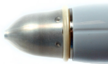
Tip Cover Fits Correctly

Make sure that the rubber cover is flat across the tip and not too taut or too loose. This could cause issues with readings.