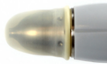
Tip Cover too loose