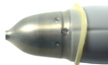
Tip Cover too tight